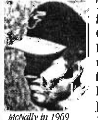
McNally in 1969